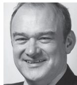
Ed Davey MP, Leader