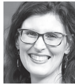
Layla Moran MP