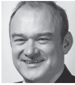
Ed Davey MP, Chair