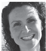
Wendy Chamberlain MP