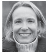
Helen Morgan MP