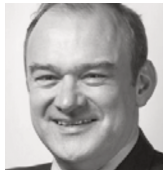
Ed Davey MP, Leader