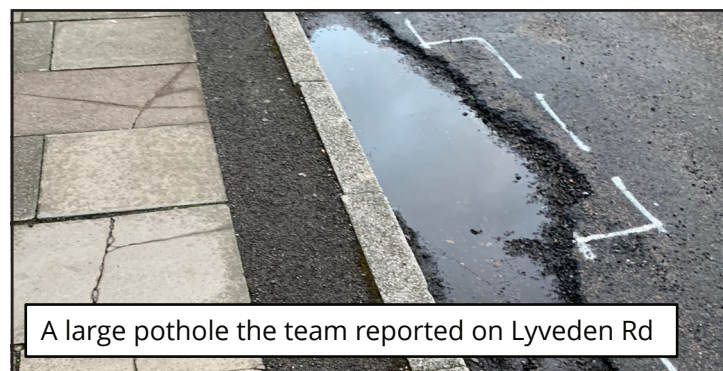
A large pothole the team reported on Lyveden Rd

Colliers Wood Lib Dems are fighting to improve our roads and pavements, reporting damage and large pot holes to the Council to be filled in, and monitoring them to make sure works are completed.