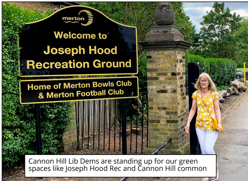
Cannon Hill Lib Dems are standing up for our green spaces like Joseph Hood Rec and Cannon Hill common

Merton Lib Dems are calling for a new 'Parks Promise' to ensure Merton's green spaces receive the care and investment they deserve.