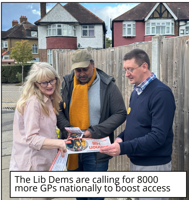
The Lib Dems are calling for 8000 more GPs nationally to boost access

Conservative policies have led to an NHS and GP crisis, making it difficult for residents to see a doctor.