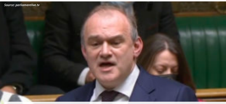
Taking on Boris Johnson: I led the calls in the Commons for the Prime Minister to resign, for breaking lockdown rules and then misleading Parliament about parties in 10 Downing Street. Above: Ed challenging Boris Johnson in the Commons. Last year Ed's questions ranged from extra support for carers to the Government's planning reforms, from Afghanistan to COP26 and climate change.