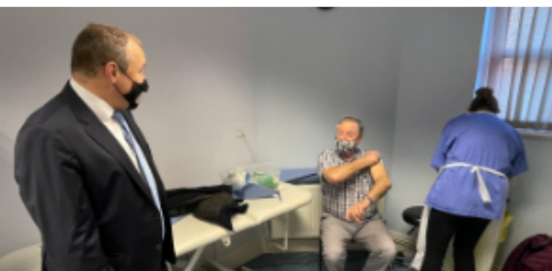
Vaccinations for over 80s: Kingston University kindly let local GP practices use their health centre premises as a temporary site for vaccinations for the Borough's over 80s. Above: Ed visiting Kingston's first vaccination centre at the University. Please remember – the NHS will be in touch when it's your turn to be vaccinated. Find out more at: nhs.uk/coronavirus