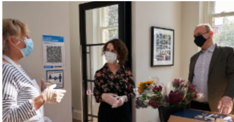
Foodbanks and community help: The work of volunteers and council staff with local foodbanks have been a lifeline for many local people. Above: Luisa Porritt (the Lib Dem candidate for London Mayor) joined Ed on a visit to a foodbank, where we helped give out groceries.