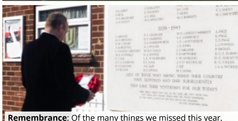
Remembrance: Of the many things we missed this year, the cancelling of almost all Remembrance Sunday services was very difficult. I laid a wreath at the Cenotaph with other party leaders at a much reduced ceremony. Above: Laying a wreath at Chessington's war memorial. With so many lost to Covid, laying wreaths alone at the Borough's memorials in Chessington, Kingston, New Malden and Surbiton, was particularly poignant this year.