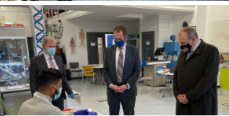
Protecting students and asymptomatic testing in Kingston: Kingston University have set up a Covid testing centre at their Penrhyn Road site, for students, staff and the local community Above: Ed visits the University's testing site, where local people have been accessing rapid lateral flow tests for Covid, even if they don't have symptoms