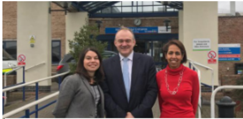
Thank you NHS and care staff: From Kingston Hospital's brilliant heroes to everyone in the NHS, care homes, pharmacies and so on – thank you! Above: this photo was taken in February 2020, before the first lockdown, on a visit to Kingston Hospital with other local Lib Dem MPs, Sarah Olney (North Kingston and Richmond) and Munira Wilson (Twickenham).