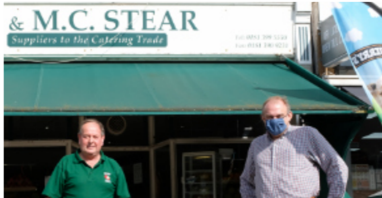
Thank you, local businesses: Have we ever been more grateful to our local shops? So many have stepped up to support local people, despite the risks. Above: Berrylands' amazing Stear's Greengrocers lost a lot of their work supplying restaurants and hotels, but worked doubly hard for residents.