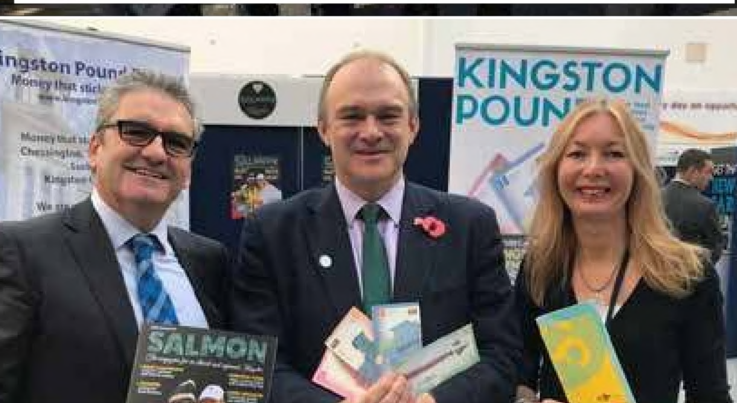
Chessington Business Expo: it was great to attend the first ever expo to celebrate business in the South of the Borough, organised by Kingston's Chamber of Commerce. The second expo is on 6 th November at Chessington School – book your ticket!