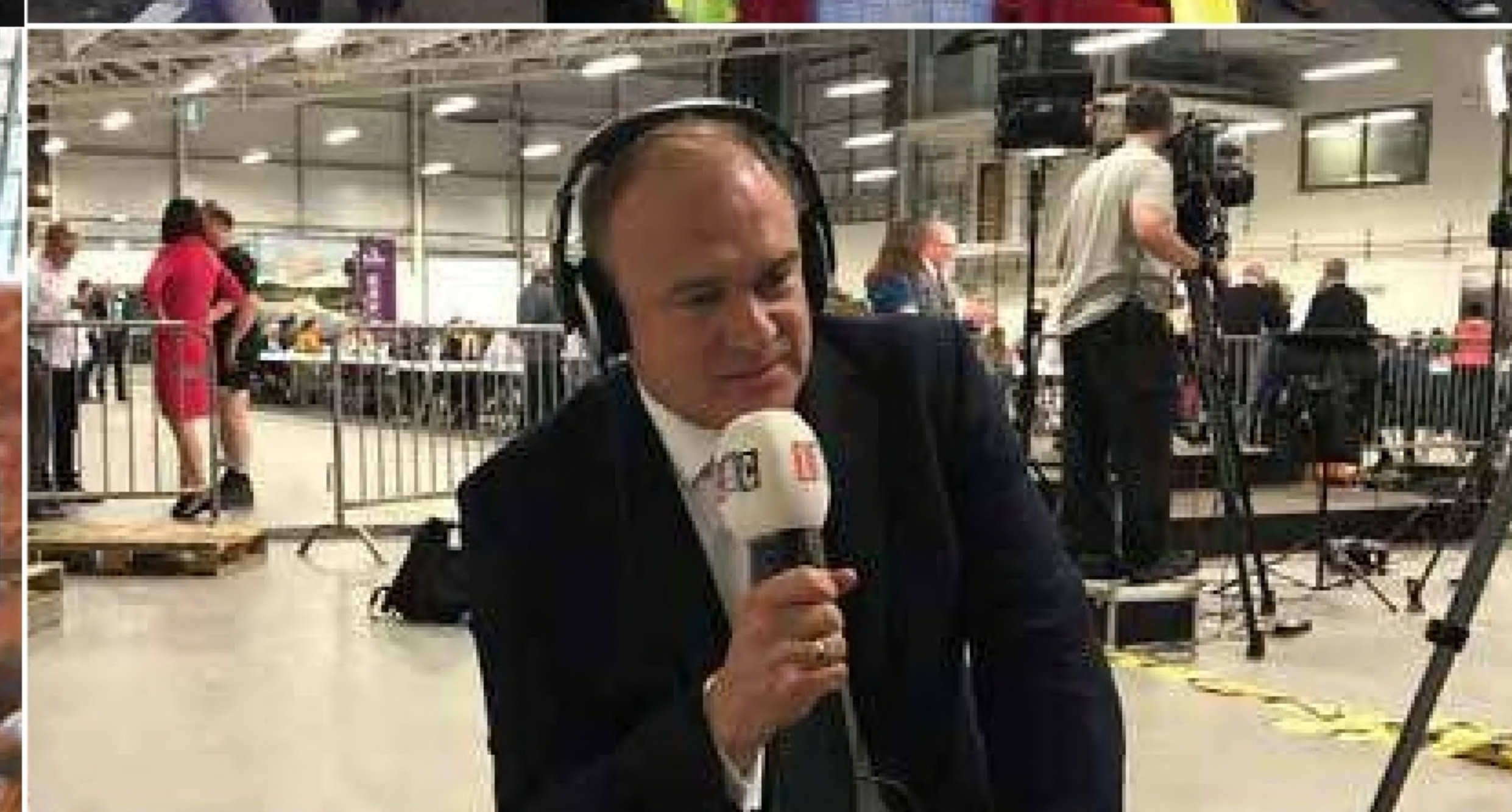
Media: with British politics in crisis, I've not only been busy at Westminster, but also the media have been keen to understand events. I'm worried about both Mr Johnson's Brexit and Mr Corbyn's policies: they both threaten the break-up of our United Kingdom.