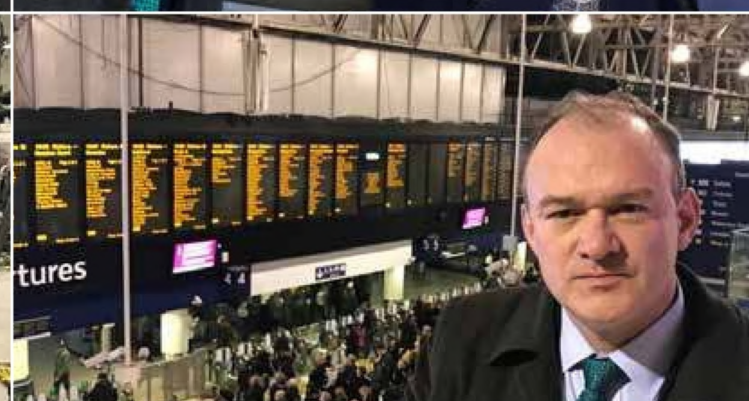
Trains: after a disastrous 2018, local train services still aren't reliable enough. Having set up a new cross-party group of MPs to hold SWR and Network Rail to account, I wrote a report calling for major change – published on my website at: www.eddavey.org/passengers-first .