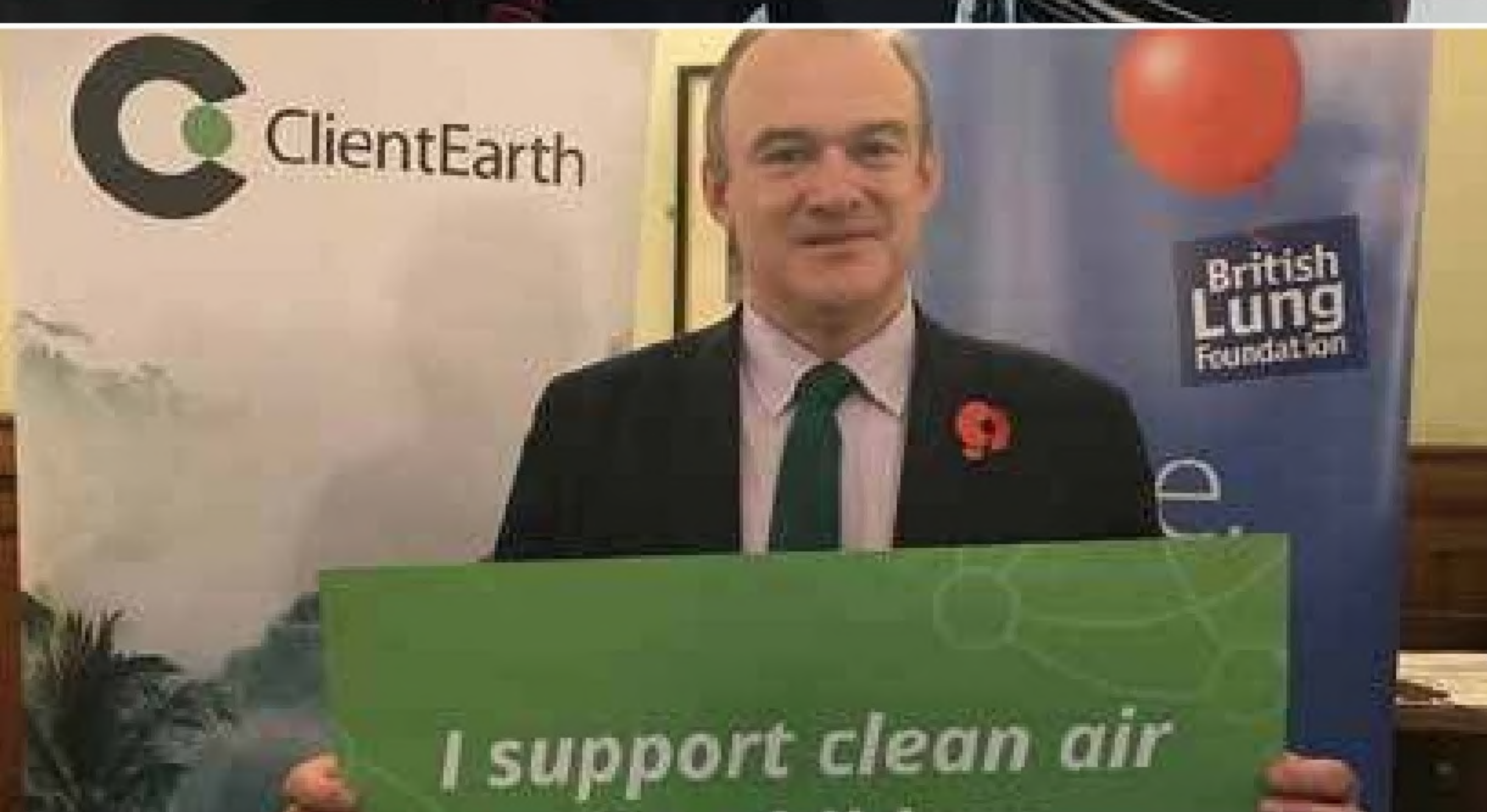
Health: the evidence of links between pollution and bad health just gets even stronger – especially with issues like air pollution. So as well as campaigning for clean air, I'm looking at other health benefits from taking the environment more seriously.