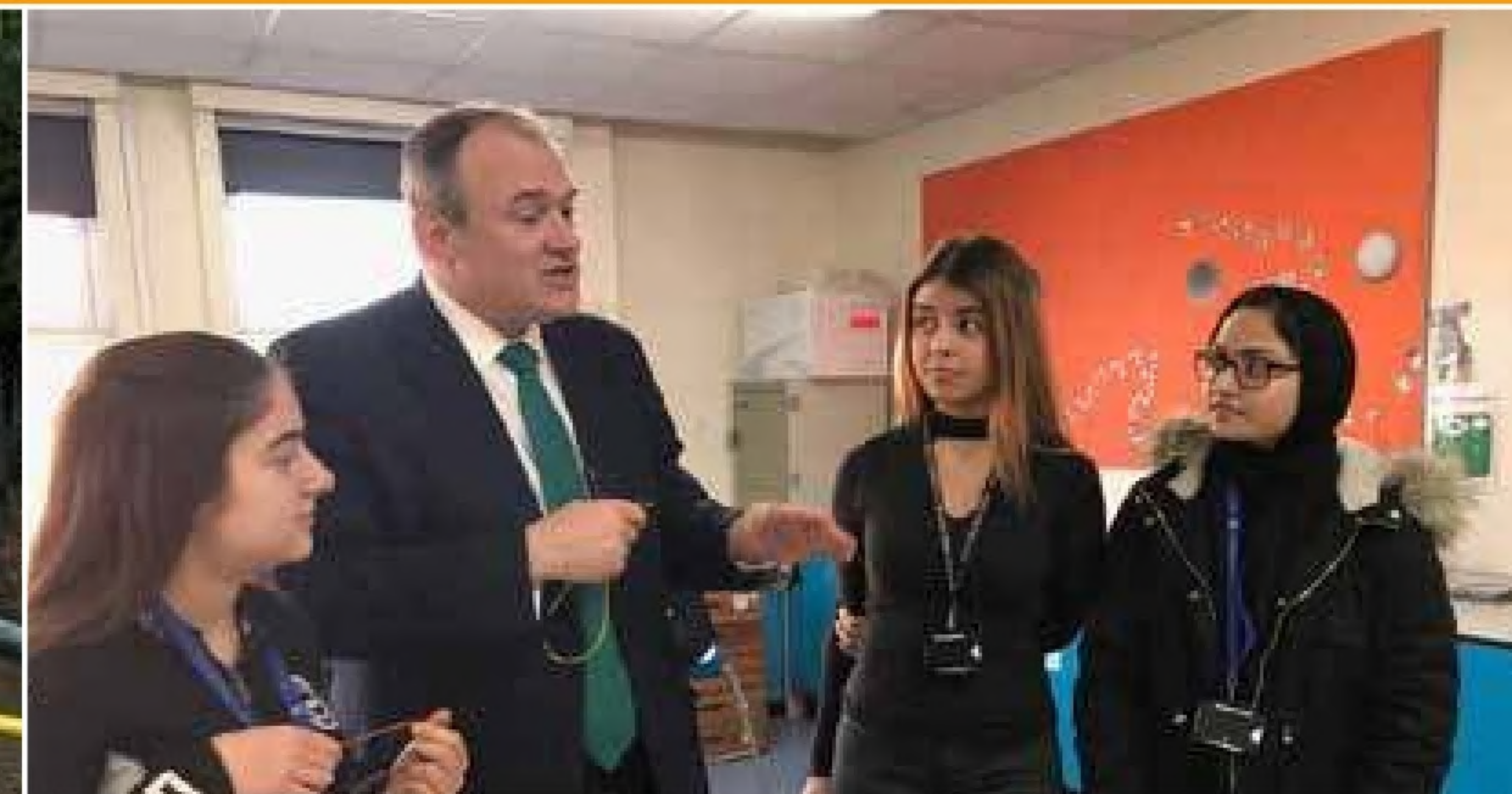
New teaching block at Tolworth Girls School: I was proud last November to open TGS' new building – with its science suite, theatre, catering area & sixth form facility. The students above were helping me remember some physics!