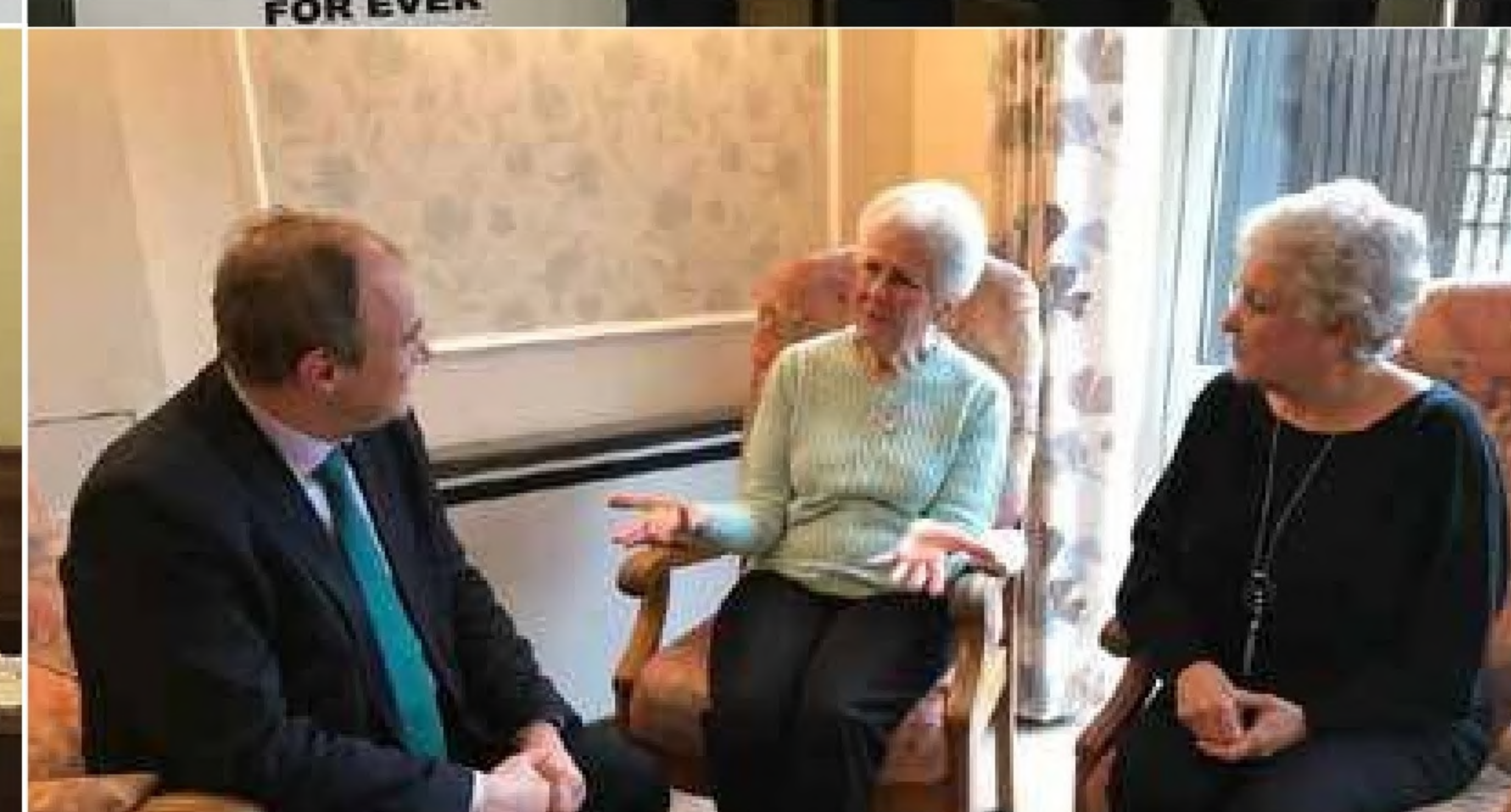
Senior citizens and leaseholds: a number of people living in retirement apartments have had problems with managing agents and/or freeholders. As vice-chair of a cross-party group of MPs on leasehold reform, I've given advice and support.