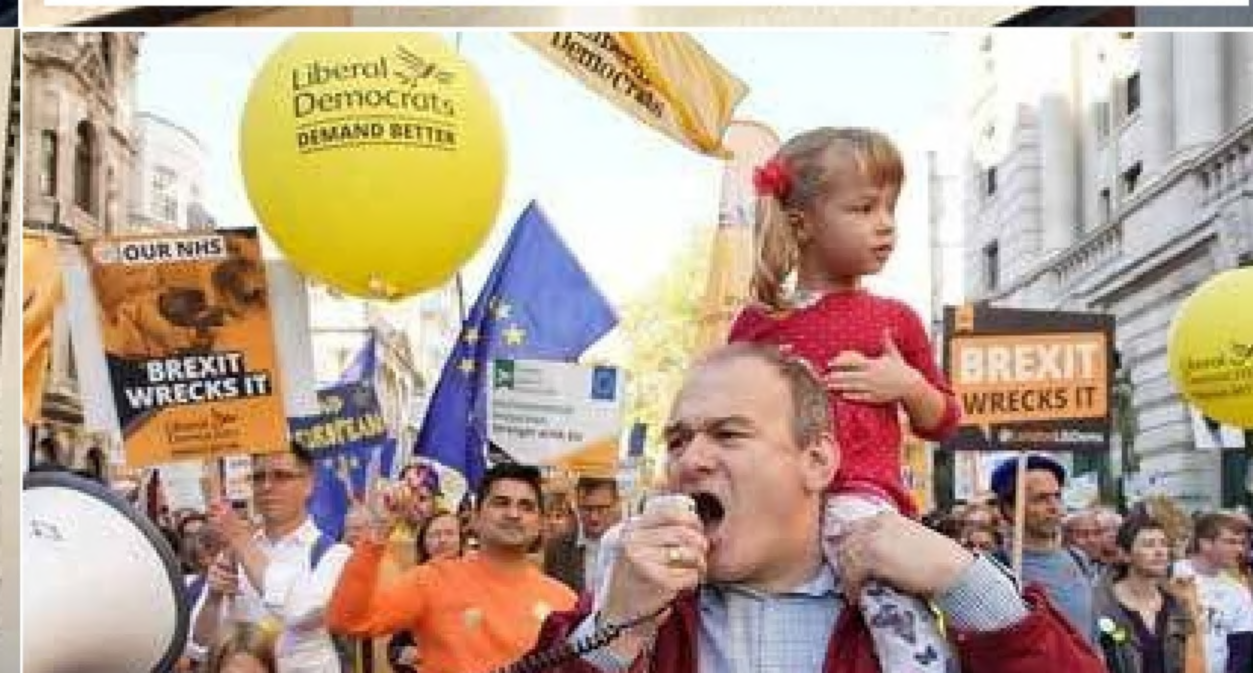
Brexit: Liberal Democrats are the strongest remain party, campaigning to stop Brexit. As democrats, we believe people have the right to change their minds and so want to give the British people the final say on whether Brexit goes ahead.