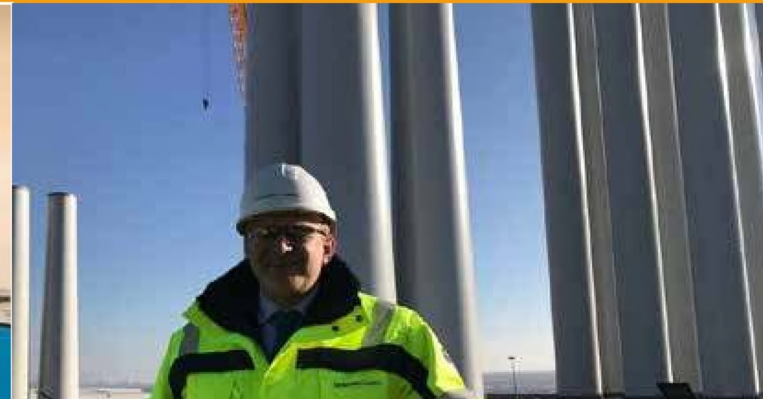
Environment: campaigning for action on climate change is key to my national work. Above, I visited the turbine blade factory in Kingston-upon-Hull – as Secretary of State for Energy, my decision to invest in offshore wind led to the factory being built, creating 1,000 green jobs.