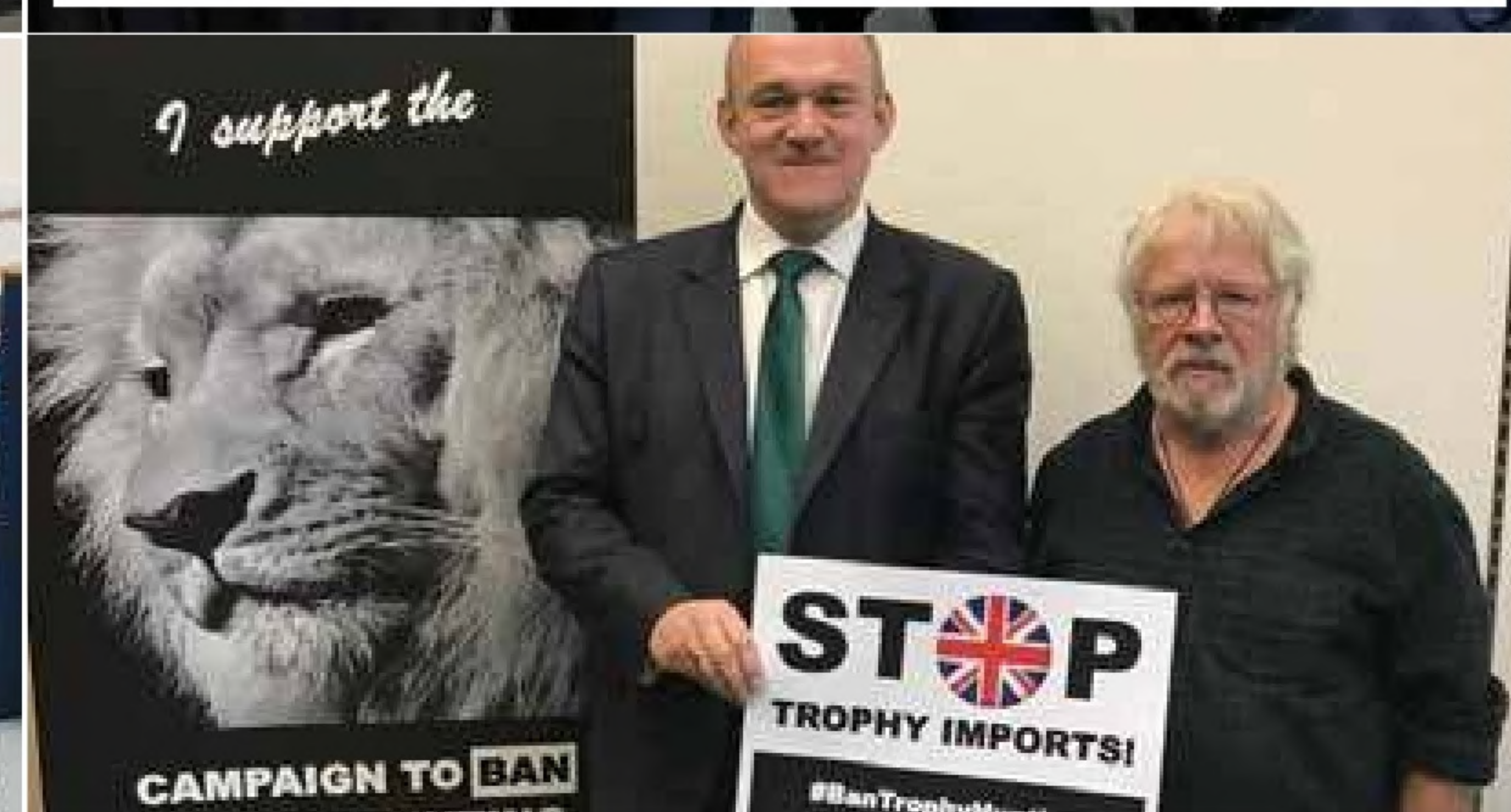
Wildlife: I joined a cross-party campaign to ban trophy hunting – to stop hunters killing endangered species and importing their “trophies” back to the UK. I also got to meet Bill Oddie – “the Goodie” – (see above)!