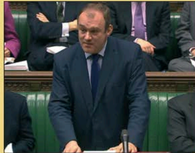
Edward at the Despatch Box in the House of Commons for his first Question Time as Secretary of State for Energy and Climate Change.