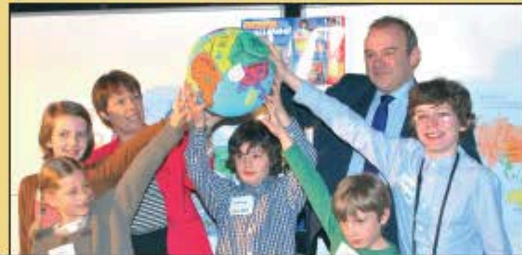
Edward meets winners of the National Geographic My2050 Competition - who all understood how dangerous climate change is to our planet!