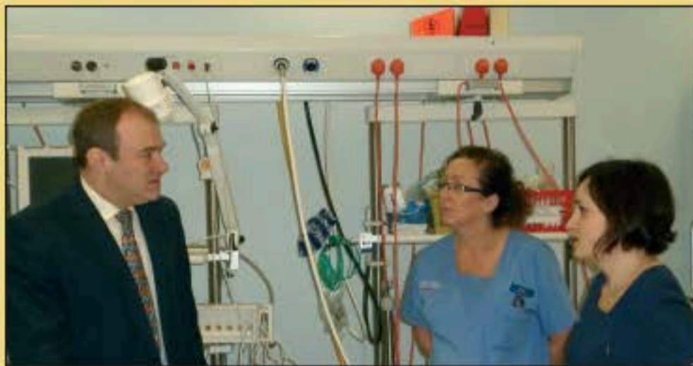
Edward visiting Kingston Hospital's Accident and Emergency Unit last year. "The high performance of the unit helped protect it from the threat of closure experienced elsewhere in London," he said.

Visit www.edwarddavey.co.uk to read more about Edward's work for our area