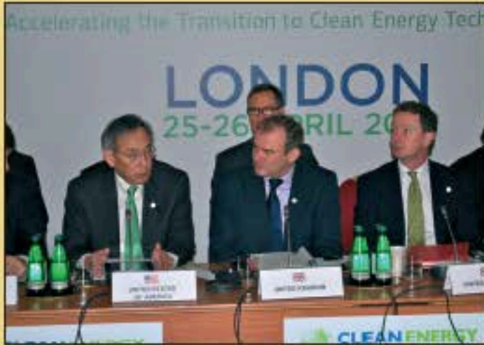
Edward hosting the Clean Energy Ministerial - a meeting of 23 leading nations to discuss how we accelerate progress on renewable energy and energy efficiency.