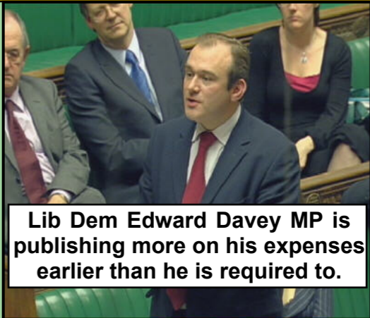
Lib Dem Edward Davey MP is publishing more on his expenses earlier than he is required to.

I voluntarily report on the allowances I claim. However, as the abuse of "MPs' expenses" is in the news I am also reporting those I do not claim, but am eligible for. Allowances Claimed: Office costs (e.g., rent, rates, utility bills) Staff pay - 3 full time equivalents. Stationery & office equipment (postage, photocopier, printer) Travel (as a Lib Dem Shadow Minister) Total £126,983 (06/07) - last available figures