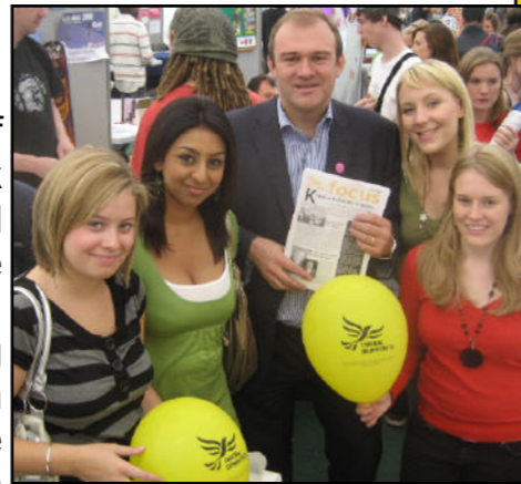
His concerns over debt, for example, lead to his opposition to policies such as student tuition fees.

A growing part of Edward's casework is helping local families who struggle with problems of debt, affordable housing and tax credits. From dealing with these problems he can push for national policy changes at Westminster.