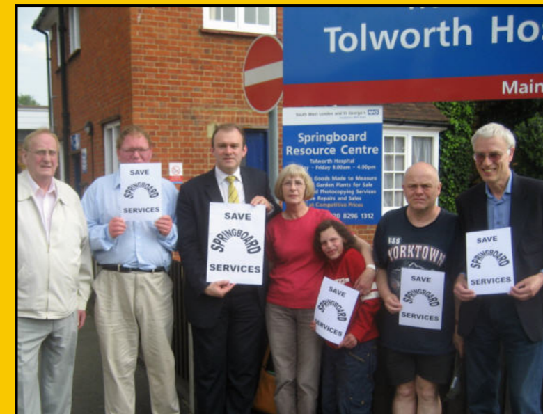
MP Edward Davey led the successful campaign to save services for people with learning disabilities and mental health issues. The NHS will now pay the voluntary sector to provide care services for users of the Springboard Centre.

Much of my work in 2007/8 was spent campaigning on health. The biggest concern in early 2007 was the budget crisis at Kingston's Primary Care Trust, so I launched my campaign "Stop NHS Cuts". Some cuts still occurred, but far less severe than feared. This was partly due to Government Ministers relenting under pressure - Kingston PCT got a better settlement than expected - and partly the PCT's better internal controls, such as more generic drug prescriptions. Another key NHS success was persuading the PCT to re-provide some mental healthcare services in the voluntary sector, rather than ending them altogether (see the story on Springboard inside). I also won the fight for local diabetic retinopathy screening, a service that helps prevent blindness. Working with the RNID, I found Kingston Hospital had the UK's longest waits for fitting digital hearing aides: I won a guarantee these will now fall sharply. With Kingston's NHS cash crisis largely over, my focus can shift back to Surbiton Hospital's future.