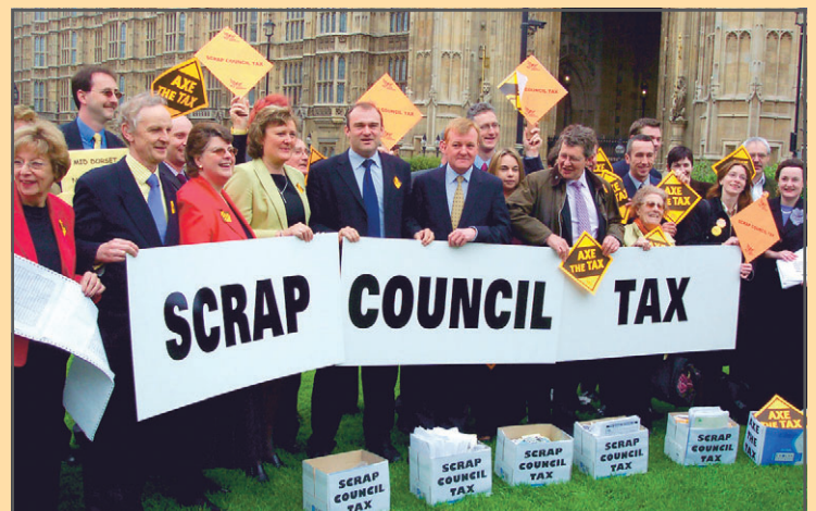
Edward Davey and other Lib Dems hand in a national petition against the unfair council tax

I voted for a Private Member's Bill to tighten regulations on fireworks and backed Government plans to reform emergency powers legislation.