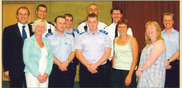
Chessington's Safer Neighbourhood team marks a success for the “bobbies on the beat” campaign

However, 2 new threats to the local crime fight have arisen. First, a threat to close New Malden police station. Second, the review of “core” police numbers in London could reduce our local core team. Campaigning continues.