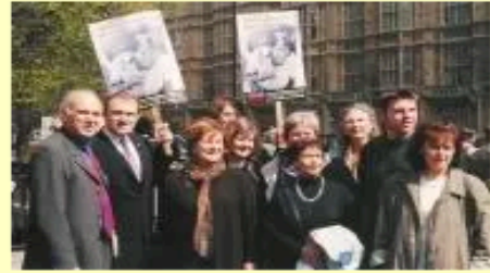
Edward Davey with other Lib Dem MPs, continue the Jubilee 2000 campaign to "drop the debt" for the poorest countries

Meeting Ministers, receiving constituency lobbies or presenting petitions are essential parts of the job.