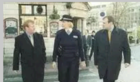
"Kingston's police should be on the local beat, not forced to travel to Wimbledon if they close our Courts." Edward Davey MP.

Good elderly care will also help the NHS, freeing up beds. The Government's NHS policy will not work unless this care crisis is tackled.