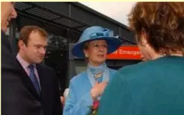
Edward Davey with Princess Alexandra at the opening of Kingston Hospital's new A&E unit

The opening of Kingston Hospital's new Accident and Emergency Unit was the year's highlight. The building is impressive, but people can still suffer long waits. We need more staff and more beds - in the rest of the hospital and in local care homes. The extra NHS cash in the budget was welcome and will help - it's something I've long argued for. Locally, we must ensure we get our fair share and that it's well spent. Moreover, we've still many challenges - whether it's improving hospital cleanliness and parking or developing new GP services and provision of devices like digital hearing aids.