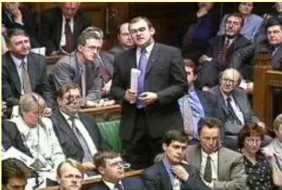
Edward Davey at Prime Minister's Questions raising concerns on the safety of nuclear power stations from terrorist attack